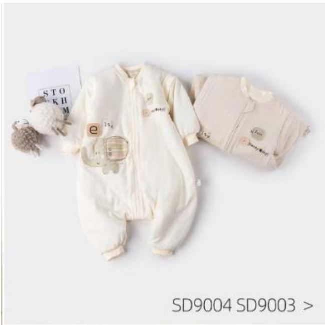
SD9004 SD9003 >