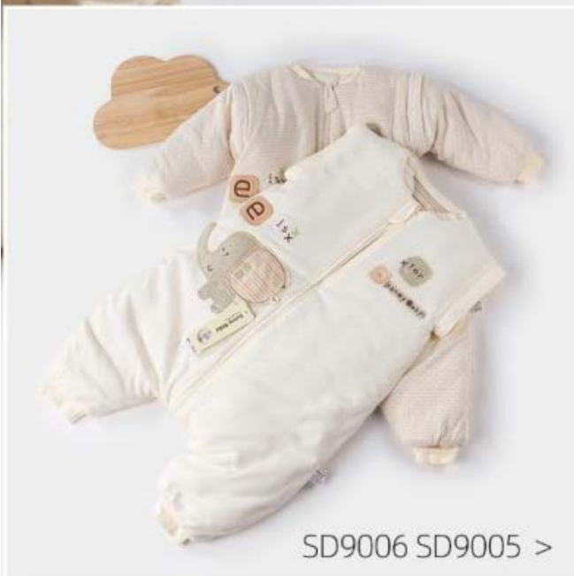
SD9006 SD9005 >